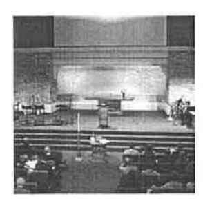
Celebration Worship uses a praise band and the order of worship and song lyrics are projected on the wall. [9 & 10:30 a.m. Sundays in the Celebration Center on the west end of the church]