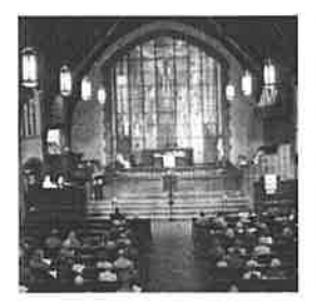
Traditional Worship follows a liturgy and the music centers around the organ and piano. The order of worship is inserted into the bulletin. [9 a.m. Sundays; 1:30 p.m. Wednesdays in the Sanctuary on the north end of the church.]

WORSHIP We believe that all instruments, all voices and all people should praise the Lord. We do not worship a "style," we worship Jesus.