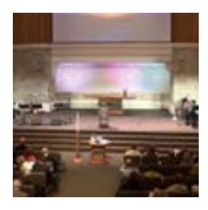
Celebration Worship uses a praise band and the order of worship and song lyrics are projected on the wall. 9 & 10:30 a.m. Sundays in the Celebration Center on the west end of the church

Wednesdays in the Sanctuary on the north end of the church