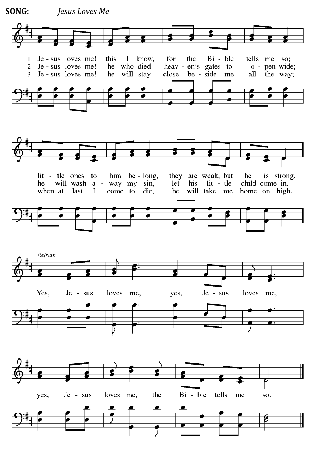
(please stand as you are able)