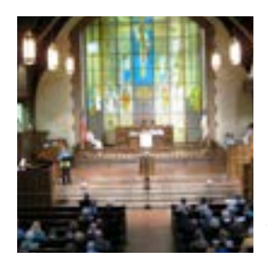
Traditional Worship follows a liturgy and the music centers around the organ and piano. The order of worship is inserted into the bulletin. 9 a.m. Sundays in the Sanctuary on the north end of the church; 1 :30 p.m. Wednesdays in the Chapel.

WORSHIP We believe that all instruments, all voices and all people should praise the Lord. We do not worship a "style," we worship Jesus.