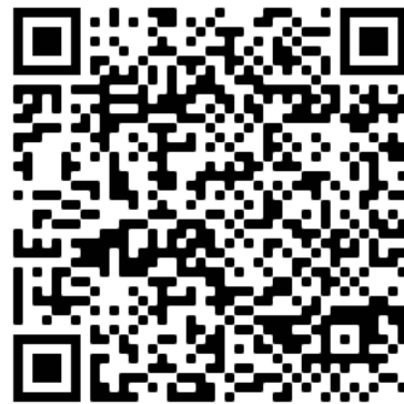
Fargo Basketball Academy

Join us and discover a little something about Jesus and basketball.