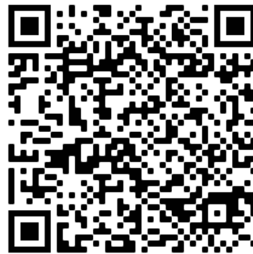
Fargo Basketball Academy

Register by scanning the codes or by visiting our website flcfargo.org