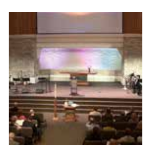
Celebration Worship uses a praise band and the order of worship and song lyrics are projected on the wall. 9 & 10:30 a.m. Sundays in the Celebration Center on the west end of the church